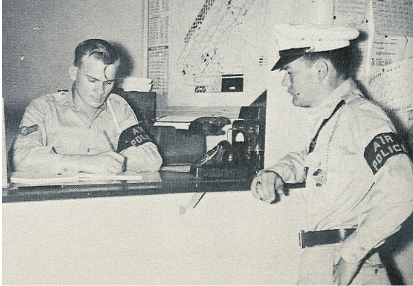
England AFB, LA, 1955