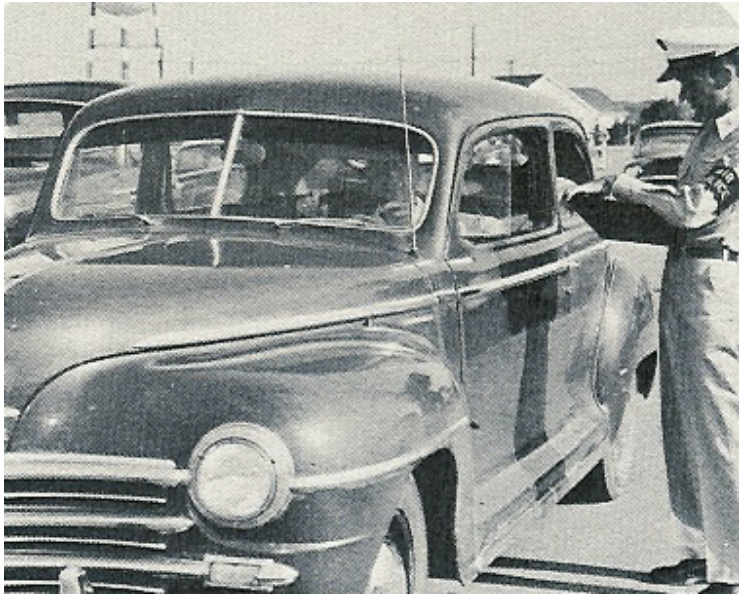
Air Police checks car for safety features, England AFB, LA, 1955