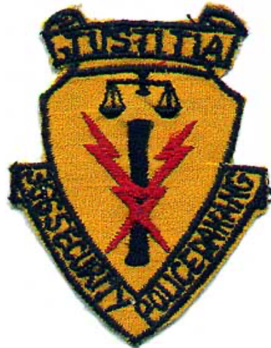
366 Air Police Squadron emblem (approved, 25 Jan 1955).

366 Security Police Squadron emblem: On a blue disc a yellow shield charged with a black baton between two red lightning bolts saltirewise below a pair of black scales and all within a narrow black border. Attached above the disc a blank red scroll bordered black and attached below the disc a red scroll bordered black inscribed "JUST TREATMENT UNDER LAW" in black letters. SIGNIFICANCE: The scales are symbolic of "just treatment" under law. The baton is an ancient symbol given to those authorized to carry out the laws and orders. The two lightning bolts, overlapping the baton, are symbolic of the responsibility charged to those carrying out the mission of the Security Police. (Approved, 12 Dec 1984).