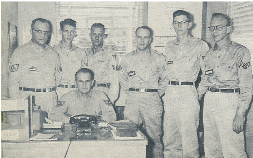
Security Flight and Confinement personnel, England AFB, LA, 1955